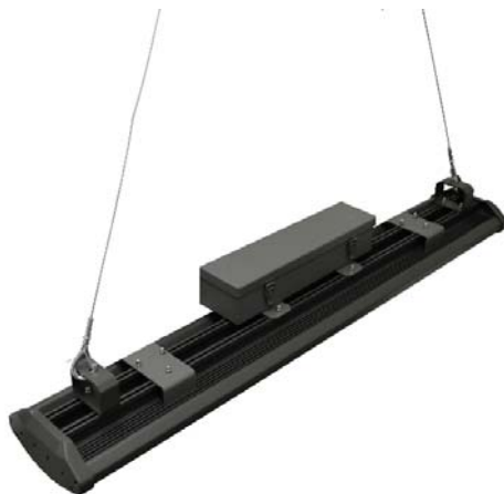
Hanging Mount Gripple Hangers Included